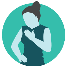
Trouble breathing or shortness of breath

If your symptoms are an emergency, call your doctor right away. Some of the emergency warning signs are*: