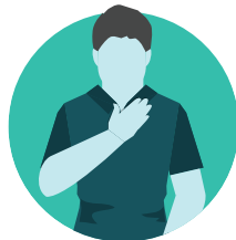
Pain or pressure in your chest that does not go away