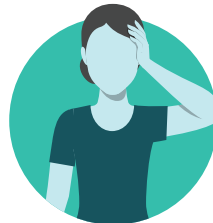
Feeling confused or cannot wake up easily